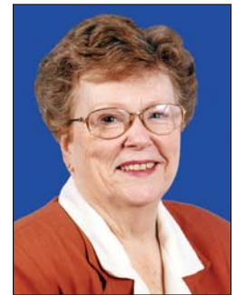
Lil Powers Satellite Schools