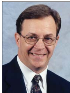
Tom Rucker Video Studio